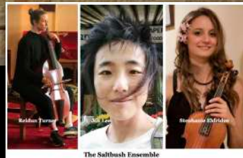
The Saltbush Ensemble

The elegance of Telemann's Paris Quartets