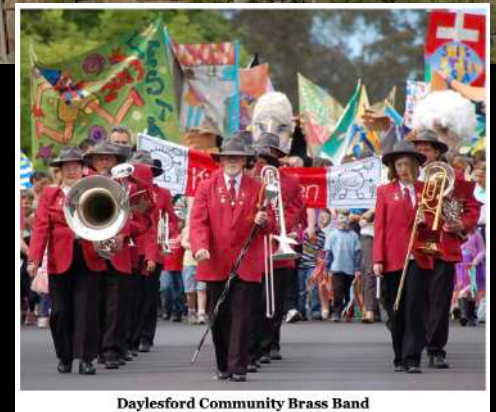
Daylesford Community Brass Band

'Light of Gold' an evocation of music's power to illuminate and inspire