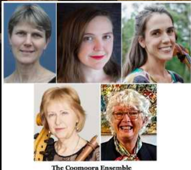
The Coomoora Ensemble

Music from the court of Versailles played on a baroque musette,